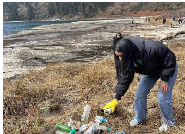
Photo plate 1: Cleanliness Drive being conducted by the students, faculty members and members of the Dept. Of Fisheries