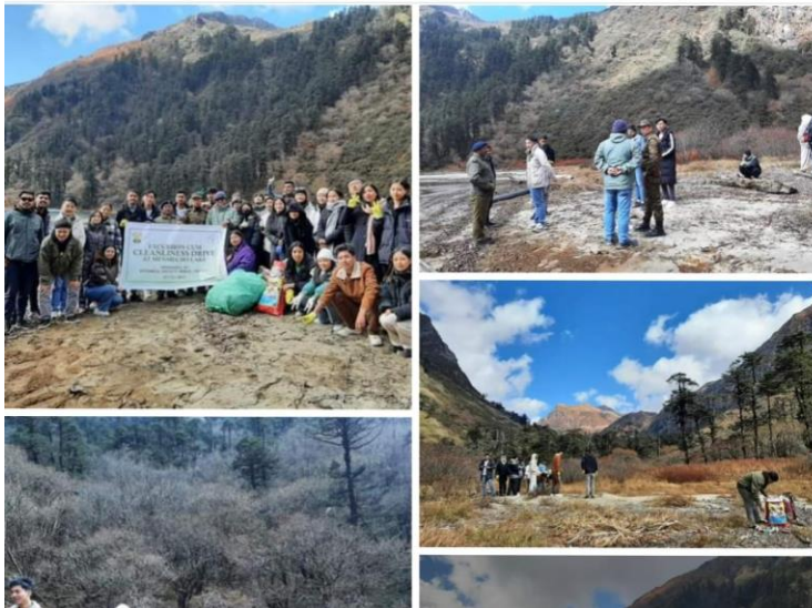
Photo plate 4: Highlighted program in social media (i) Facebook page of The Directorate Of Fisheries, Sikkim. (ii) Official Instagram handle of The Botanical Society Of NBBGC.

botanicalsociety22 Date: 7th nov 2023, Educational cum cleanliness drive in and around Menmecho lake, East sikkim done by the members of botanical society NBBDC, Tadong accompanied by the members of forest department.